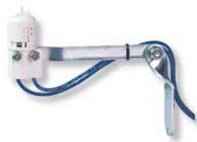
Mini-Clik Rain Sensor

The world's most simple, accurate, rugged, and reliable rain sensors